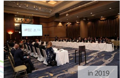
Forum & Seminar